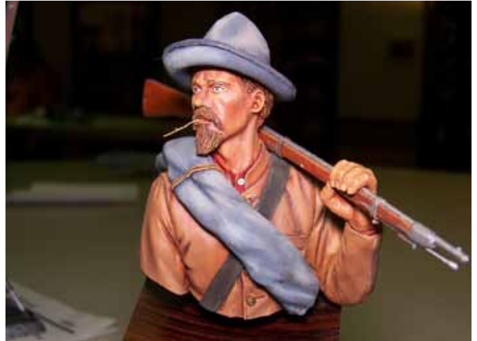
By Shep Paine, 1971, displayed by Jim Goldsmith.