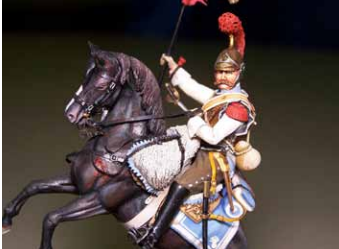
By Shep Paine, 1971, displayed by Jim Goldsmith.