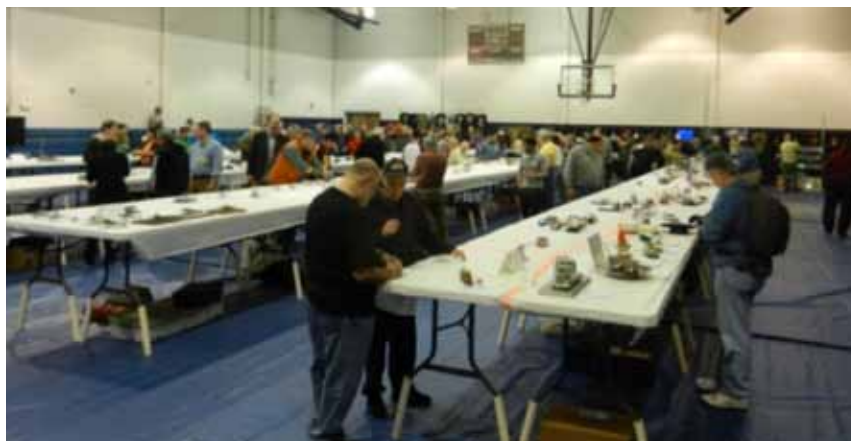
Contest tables fill up with entries at the Wayne PAL Club