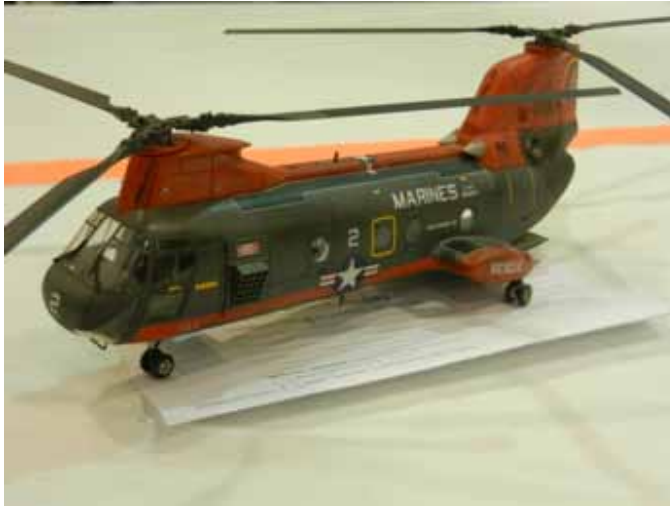
Charlie Lockard's CH46 took a third in Rotary Wing, All Scales.