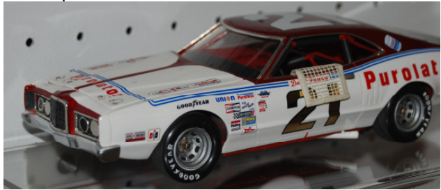
Our own Ed Sexton's 1/24 NASCAR Mercury and a 1/32 Tyrell F1 car and transporter