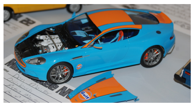
Aston Martin in Gulf colors