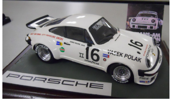
Also the latest status of the in progress Aurora Ferrari 250 glue bomb restoration.