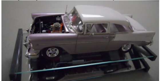
Also lots of neat aftermarket wheels and stuff.

Gerry Paquette: Revell 56 Chevy mild custom.