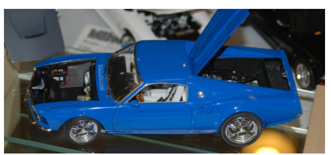
Euro Style Mustang