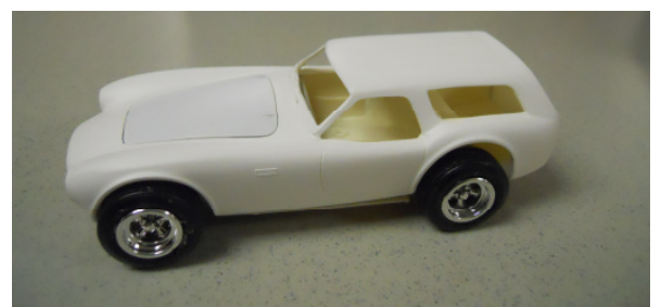
Glenn Synder : A nicely done Model Factory Hiro Alfa Romeo Type 33.