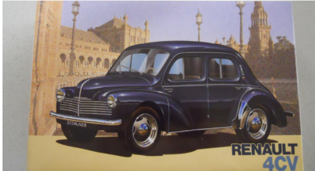
Dave Green: more new stuff, along with recent swap finds of vintage IMC kits.