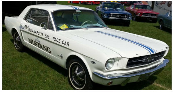
As I noted, my model was already painted and decaled nicely, so I decided to finish it up even though it was the incorrect year.

And to further confuse things, there were 190 "replica" pace cars made available to dealers after the race, based on sales performance of the dealers. But these were hardtops, not convertibles.