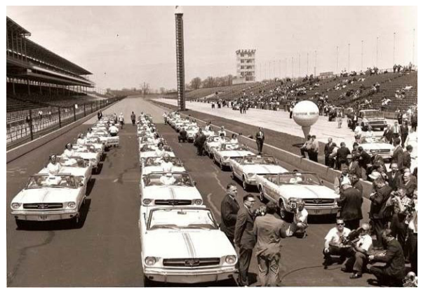
The pace cars used in the race were white, with the interior using dark blue carpet and dash with white seats. The convertible top was white, as seen below.