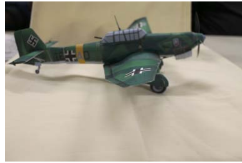
Figure 13 Dick Zoerb's Fiddler's Green cardstock Stuka.