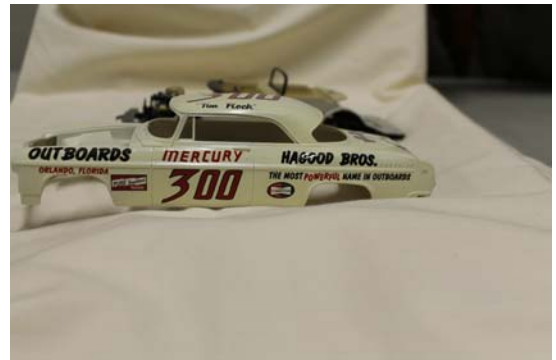
Figure 23 Tony D'Anjou's "in progress" 1/44th Moebius 1955 Chrysler 300.