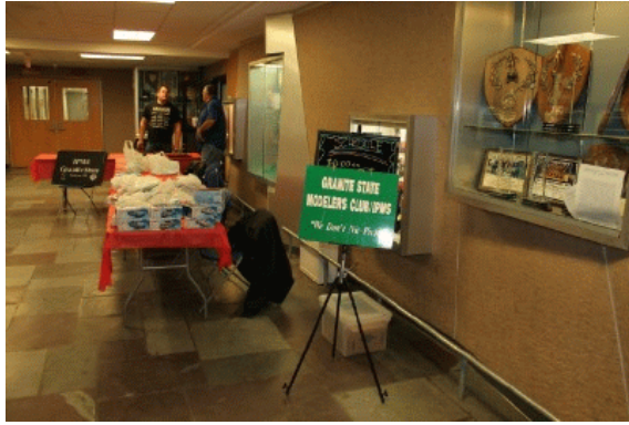
Figure 25 Granite State Modelers' display at the Milford Train show