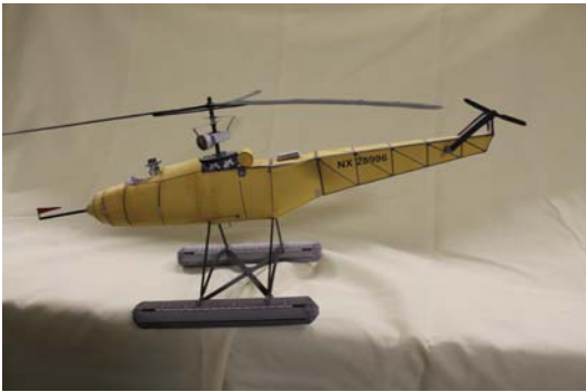
Figure 12 Dick Zoerb built this Fiddler's Green VS-300 Helicopter. Another card stock kit