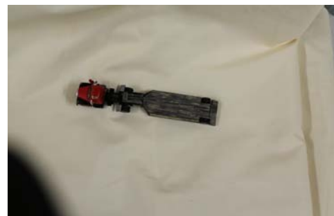
Figure 17 Paul Lessard scratch built the trailer and added new details to his 1/87th Athearn/scratch built Mack tractor and lowboy.