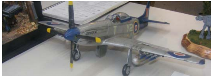
Lindell Burris' 1/24 Airfix P-51D Mustang