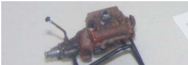
Brad Dutter's AMT 1/25 287 Chevy Engine.