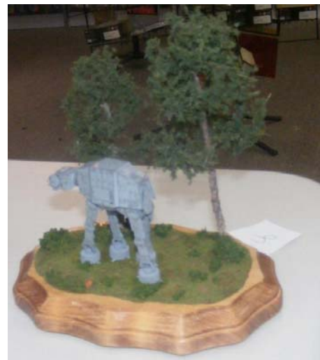
John Lee's Fascinations 1/220 AT-AT Starwars Imperial Tank