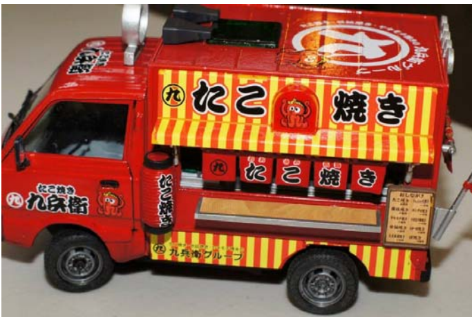
Bronze: Doug Packard's Aoshima 1/24 Shrimp Wagon.