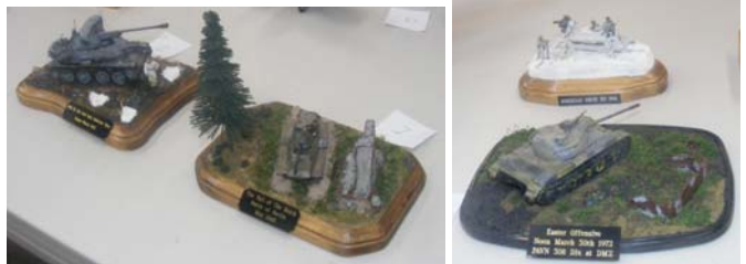
Karen Roth brought in 4 different 1/72 scale dioramas