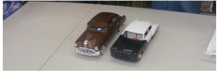
Display models by Bruce Craig above and a selection of inprocess and display models below.