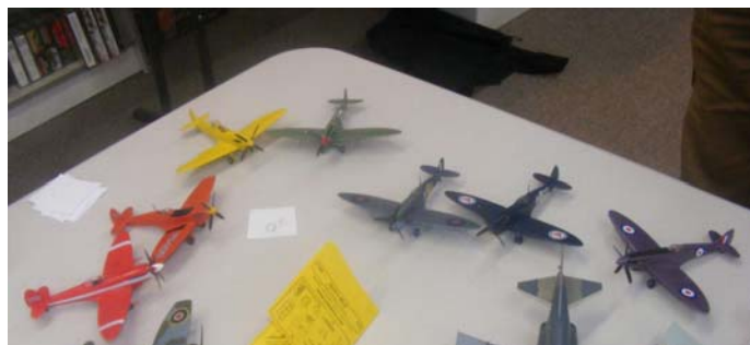
Jim Walker's 7 "Rainbow" Spitfires