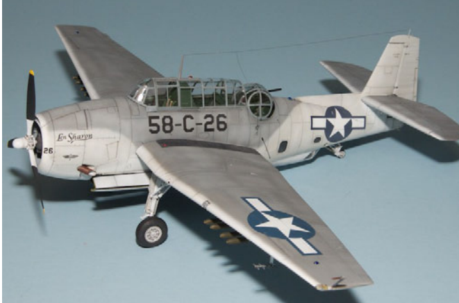
Rich Van Zandt's TBF-1C in Atlantic Search Scheme I with custom decals.