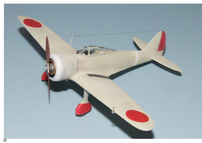
Jim Webb's Ki-27 was probably the oldest kit on the table.

managed to do the entire model without the use of any decals – everything was done with paint.