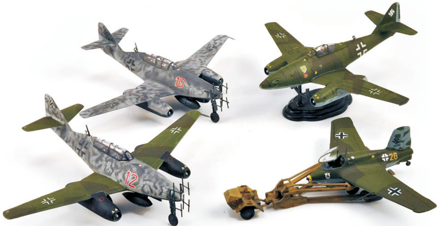
James Coleman's Luftwaffe jet fighters in 1/72nd scale