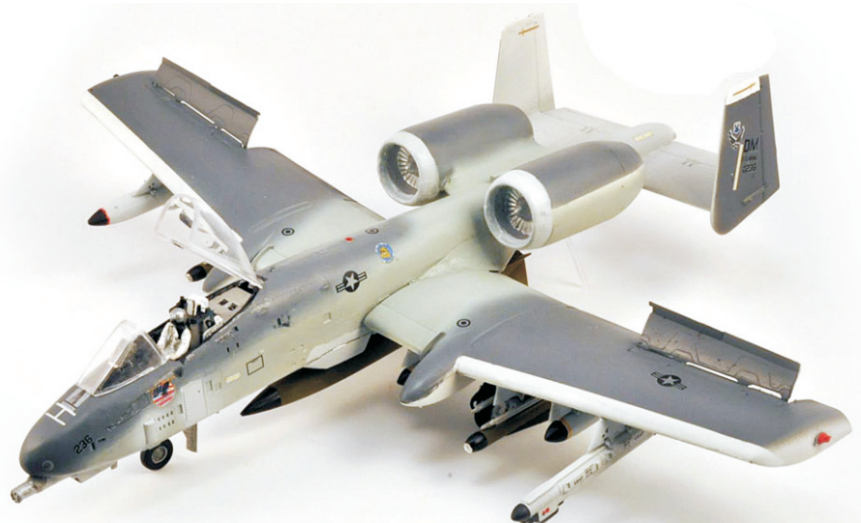
Paul Carr's A-10 Warthog in 1/48th scale