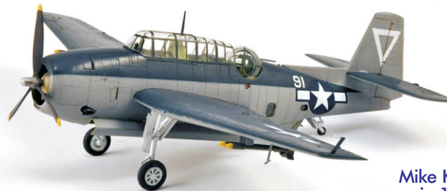
Mike King's TBM-1C in 1/72nd scale