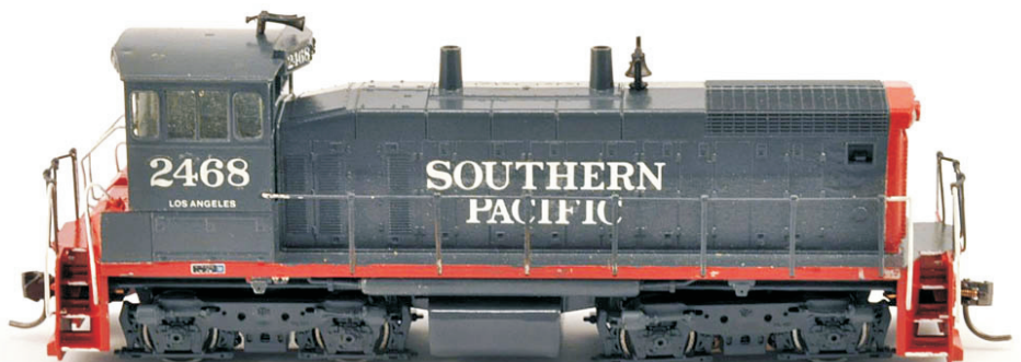
Roger Gutierrez's SW1500 yard switch engine