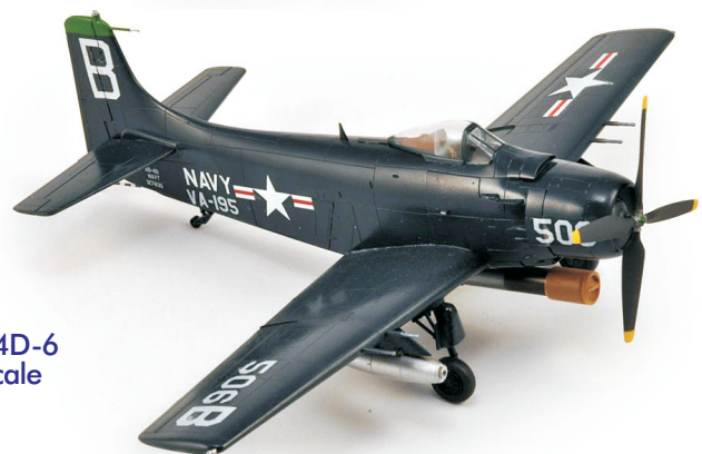
Mike King's A4D-6 in 1/72nd scale