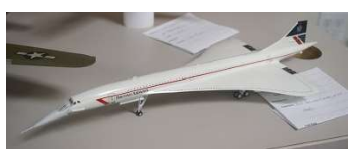
Dick Montgomery's Concorde in 1/144 by Airfix. Dick added decals from several sources.