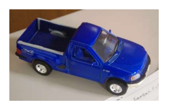
F-150 Pick-Up Truck by Rick Stanley, in 1/24 scale