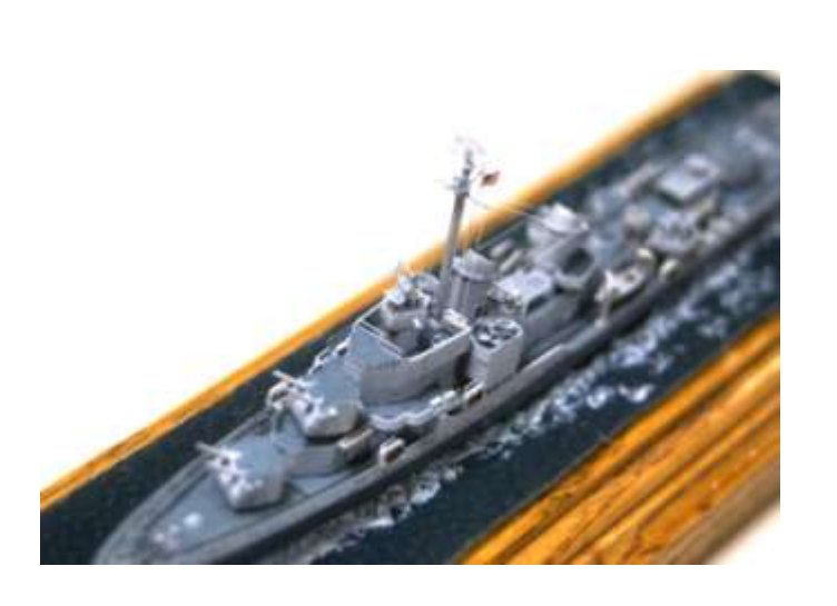
USS Sumner in 1/700 built by Rick Warring. The kit is from Skywave. Very good details!

Rob Booth brought this F-4E, with markings from the 924th TFG Bergstrom AFB, TX. He added Isracast Tiseo Camera, master model pitot & AOA Probe Model Master enamels