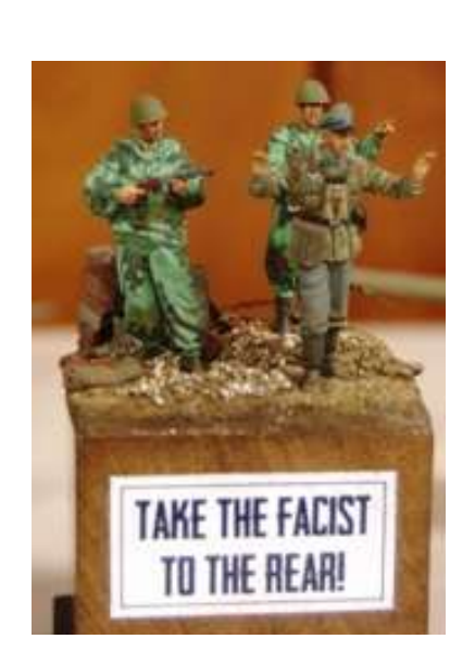
Henry Nunez painted these figures by hand with Vallejo acrylics. A nice set up of a mix of kits: Alpine figures with Hornet head warrior figures in 1/35 scale.