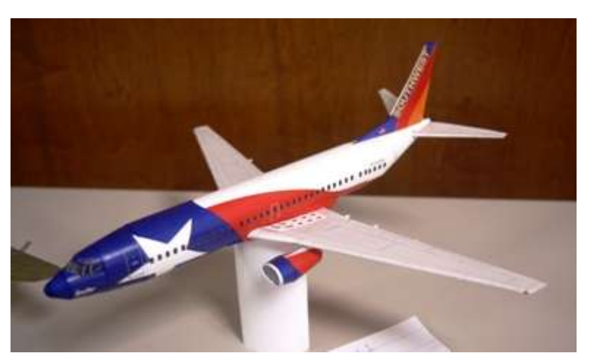
Boeing 737-300 Southwest Airlines, Lone Star One. Jerry built this paper model from Paper-Replika.com