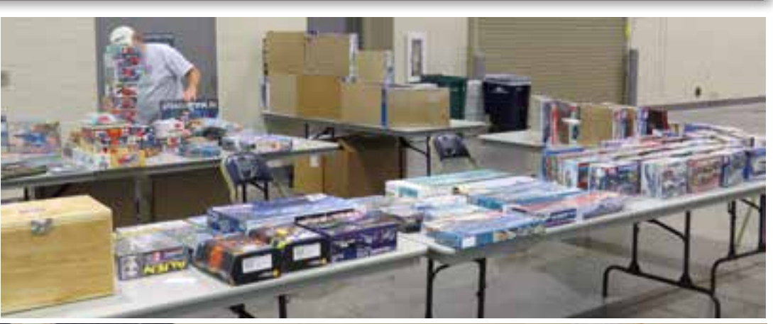
The legendary RVIPMS raffle was on steroids for the Regional. Hundreds of prizes and amazing Mega raffle prizes.