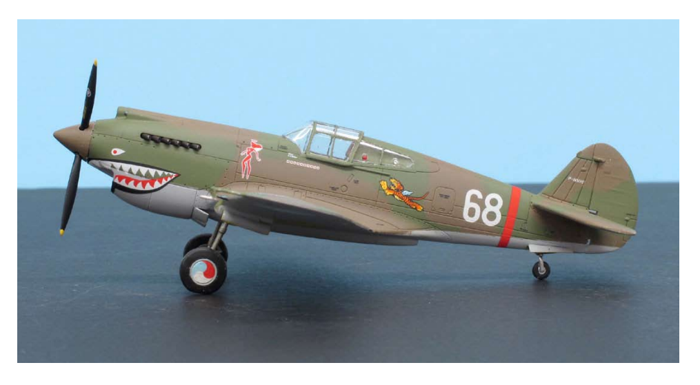
(continued on Page 4)

Ken Myers' 1/72 scale P-40B, built OOB and painted with Polly S and Testors. Decals, from the kit, are for the Flying Tigers.