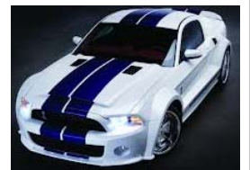
CUSTOM, STOCK, STREET, TRACK

FEATURING OUR MASSIVE RAFFLE INCLUDING A BRAND NEW IWATA NEO