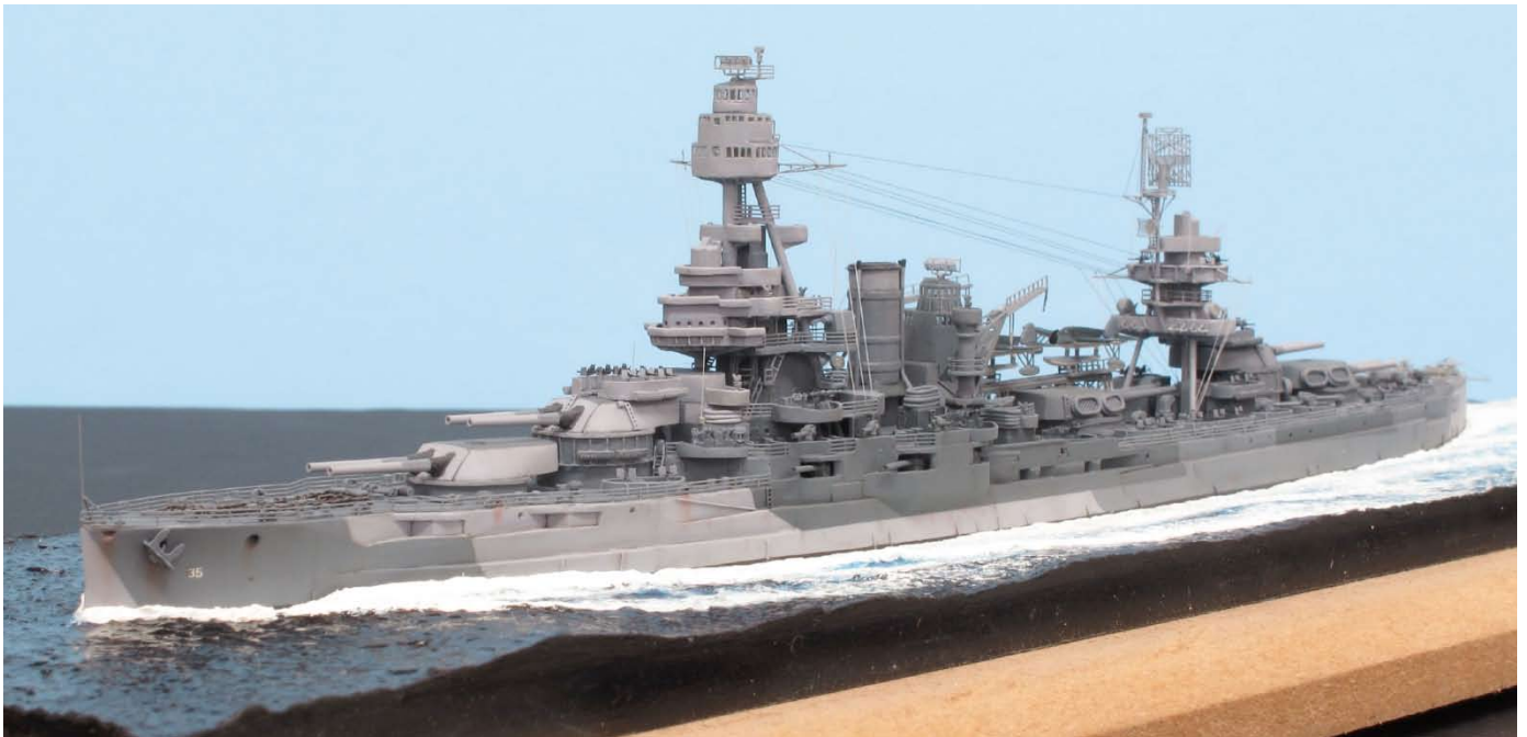
Here's another stunning model from Richard Price. It's a 1/700 scale USS Texas in 1944 fit, built from the Samek kit with additional PE and resin decks, hatches, AA weapons, railings, main gun barrels and aircraft. Richard also did major reworking of the 5th gun deck, all superstructures, and added many, many small details stem to stern. See Page 7 for another photo showing some of the amazing detail work.

The next Patriot Chapter meeting will take place on Friday, April 4, at 7:30 p.m. at the First Parish Unitarian Church in Billerica, MA. The church is located on Concord Road, just as it meets Route 3A (Boston Road) at the Billerica Town Common. The April meeting will be a build session with a business meeting, Show-and-Tell, and a raffle.