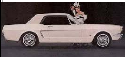
1964 TO PRESENT

FORD MUSTANG CORRAL DISPLAY OR OPEN STYLE COMPETITION