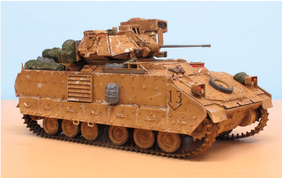
Matt Fleury's 1/35 scale M2 Bradley (Tamiya), built OOB and painted with Tamiya acrylics. Decals, from the kit, are for the Gulf War.

Pip Moss's 1/48 scale Lavochkin La-5 (Zvezda). Pip used the seat, instrument panel, seat belts and other details from a Vector mixed media cockpit set, replaced the kit's thick sliding canopy with a vacuform part from Pavla, and added antenna wires. Paint is AKAN acrylic lacquers. Decals, from AML, are for a plane flown by ace Vladimir Serov of the 159th IAP, Leningrad and Volkhov fronts, from Spring 1943 to Summer 1944. Serov achieved 39 individual and 8 shared victories, no less than 21 against Fw 190s, before being killed on June 26, 1944, when, after exhausting his ammunition, he rammed one of seven Finnish Bf 109s he was fighting single-handed.