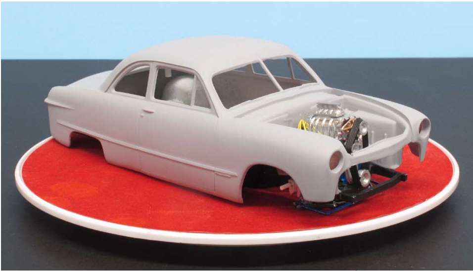
Jason Faulkner's WIP 1/24 scale Ford Custom Coupe (AMT).