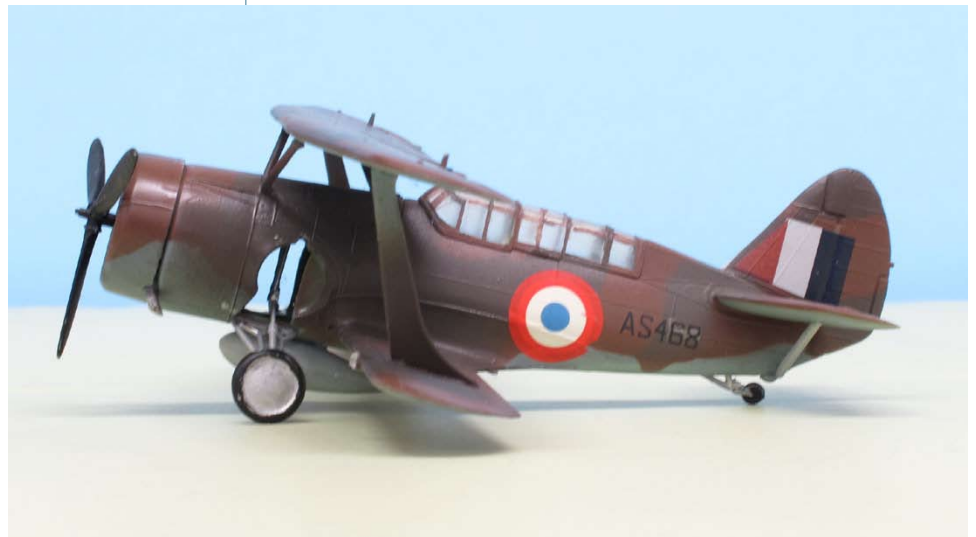
Bart Navarro's 1/72 scale SBC-4 Helldiver/Cleveland (Heller), built OOB and painted with Tamiya acrylics.