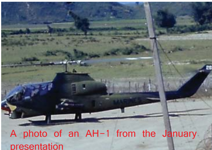
A photo of an AH-1 from the January presentation