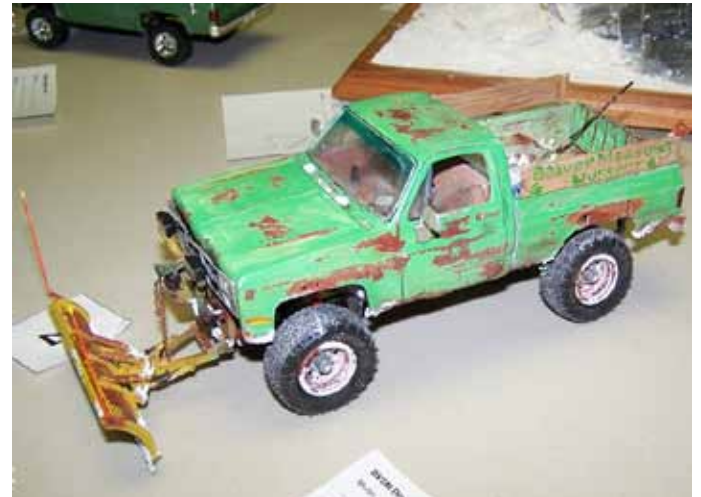
Chevy 4x4 Pickup with snow plow, 1/25, by Rod Rakos