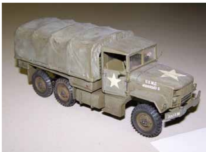
USMC 6x6, 1/35, by Tom Gill