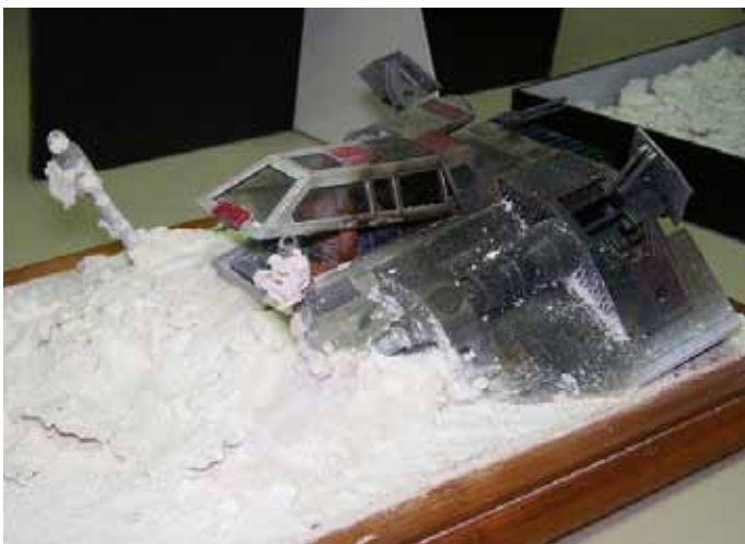
Star Wars "Snow Speeder", by Joe Leonetti