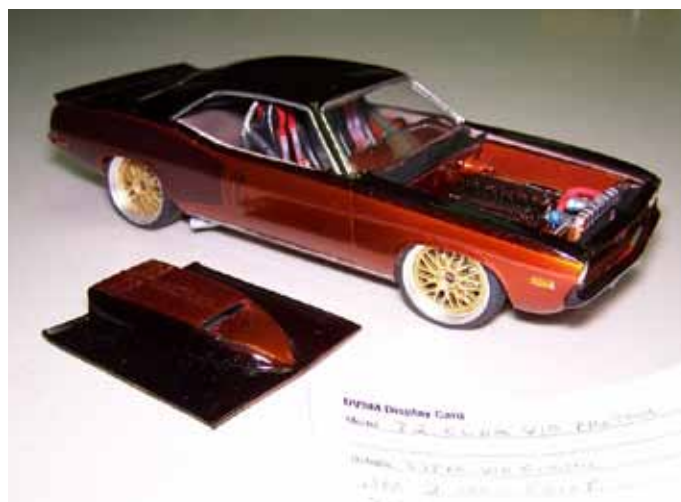
'72 'Cuda Pro Torring Custom, 1/25, by Nick Sandone