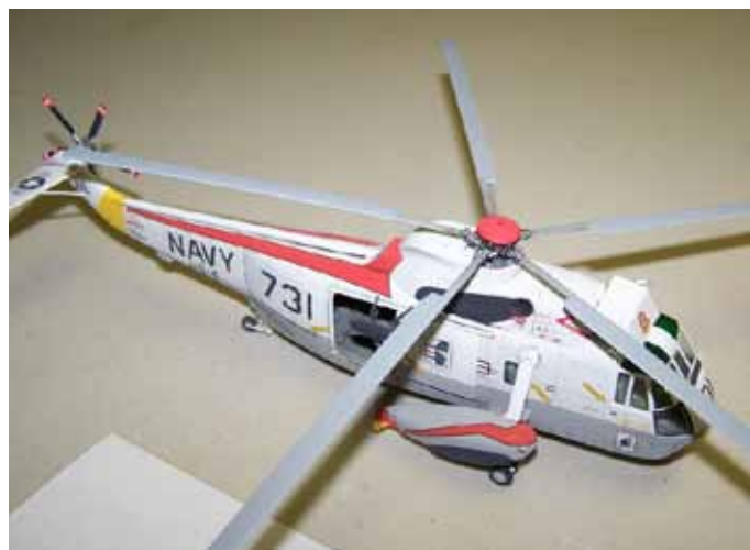
Sikorsky SH-3H Sea King, 1/72, by Joe Volz