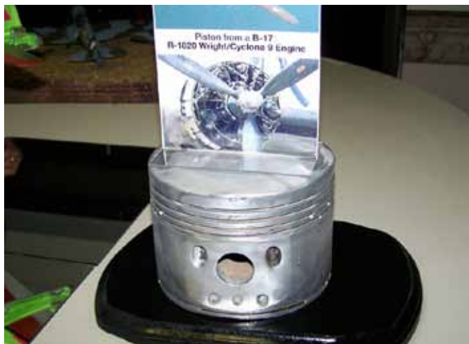
The display stand for Dave's B-17 featured a piston from a B-17 engine.