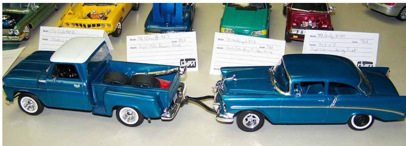
Chevy Drag Team: '65 Pickup & '56 210 Delray two-door sedan, 1/25, by Butch Haas