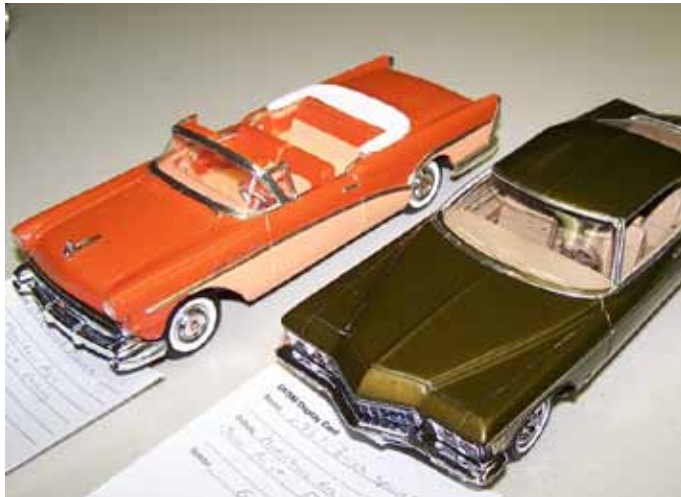
'57 Buick Special, '72 Buick Riviera, 1/25, by Greg Hogg