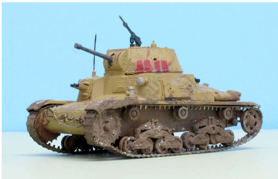
Bart Navarro's 1/35 scale Fiat-Ansaldo M13/49, built OOB and painted with Tamiya acrylics.