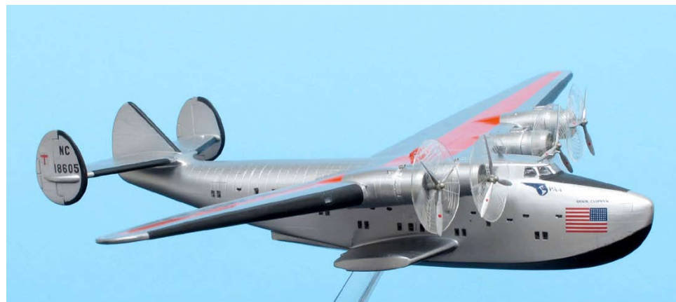
Key Myers' 1/144 scale Boeing 314 Clipper, built OOB and painted with Alclad and Testors.