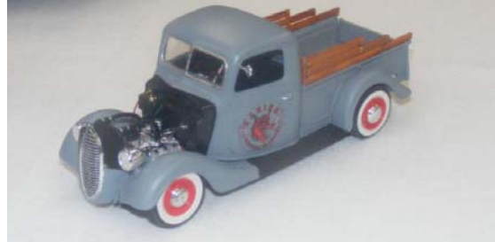
Brad Dutter's 1/25 Revell '37 Ford Pick-Up.