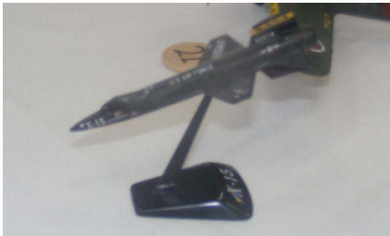
Karen Roth's 1/72 Heller X-15 Rocket Plane.