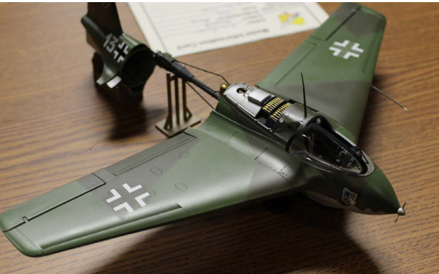
Jim Zeske Me163B Meng 1/32