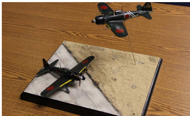
Boris Ilchenko A6M5c & A6M5b Hasegawa/Academy 1/72