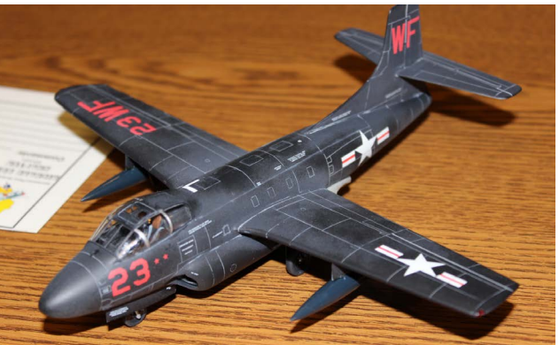
Paul Boyer F3D-2 Skynight Sword 1/72