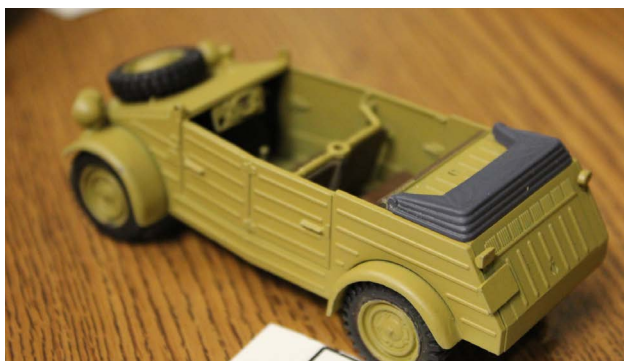
Pat Hahn Hubelwagen 1/35 Tamiya