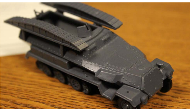
Pat Hahn Assault Bridge (251) ESCI 1/72