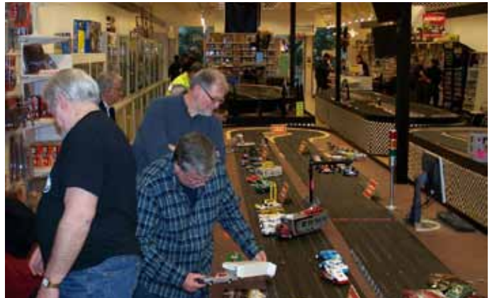
The Big Sit is held at Main Line Hobbies at the Plymouth Meeting Mall. This year's event is on February 22.