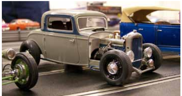
Lyle Willits brought this straight-six powered '32 Ford hot rod from Maryland for the Big Sit.