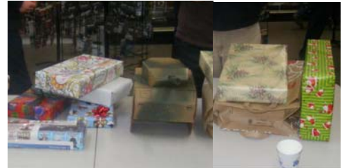
An attempt at a composite pictures of the 20 models up for exchange at the December bonus meeting