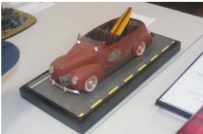
Bronze: Brad Dutter's 1/25 AMT '39 Ford Tudor Surf wagon.