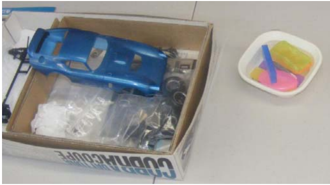
Display model and a resin mold making set on display at the December meeting.