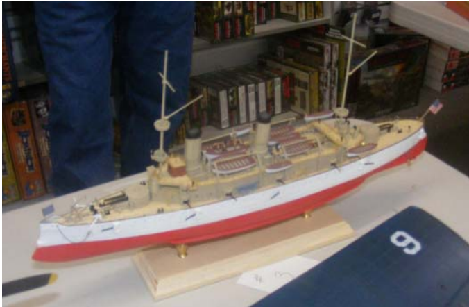
Gold: Nolan Doyle's 1/250 Revell USS Olympia.