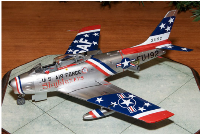
Ross Armstrong's Hasegawa 1/48 th F-86F done in the very colorful Skyblazer's Scheme.

assembly is properly placed to allow the fuselage halves to fit together correctly, Jim had no trauma with this kit. Yeah, we know, no smoke or flames involved, kinda anti-climactic, huh? Alclad products were also used for the finish on this model. The kit decals were used, but a good smooth coat of Future was required to get them to lie down smoothly, and then an overcoat of Future applied as well. Quite a nifty little jet.