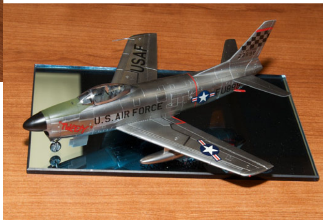
Jim Webb's 2 nd Place Hasegawa 1/72 nd F-86D.

The second place model, by Jim Webb , was a 1/72 nd scale Hasegawa F-86D, 'Dog Sabre.' Other than making sure that the cockpit tub and nose wheelwell