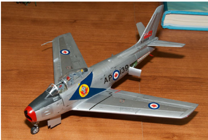
Stan Parker's Hasegawa 1/48 th Canadair Sabre Mk V.

Stan Parker had completed a 1/48 Hasegawa F-86 kit as a Canadair Sabre Mk V. This particular aircraft was flown in a painted silver scheme, not the natural aluminum finish seen on many other Sabre variants. Stan got a great deal on this kit, which he bought at a garage sale, only to find that a resin cockpit was also included in the box! He finished the model using a heavily thinned mix of Tamiya Flat Aluminum paint. Also with him, but not entered in the contest, Stan had brought a Hasegawa 1/48 Sabre converted to an RF-86F model. This one was painted in a combination of Tamiya Flat Aluminum and Testor's Steel. Nice model, but we have to admit the large camera bulges on the fuselage sides don't really make the sleek F-86 more attractive!