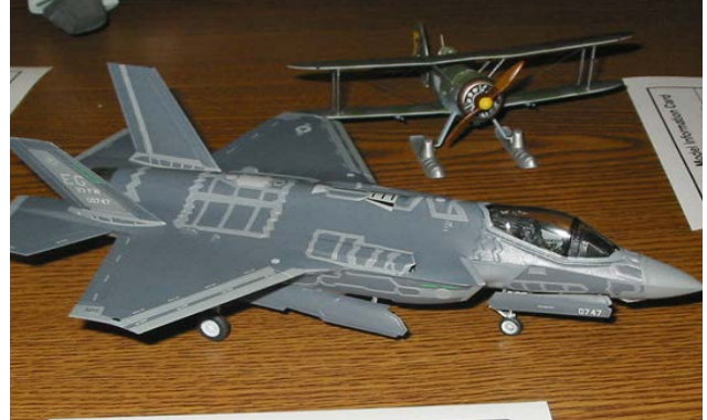
Paul Boyer F-35 A Italeri 1/72