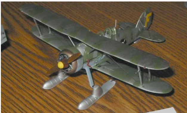
Phil Pignataro Gloster Gladiator Airfix 1/72