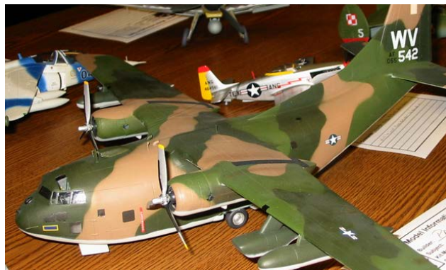
Paul Boyer C-123K Mach 2 1/72