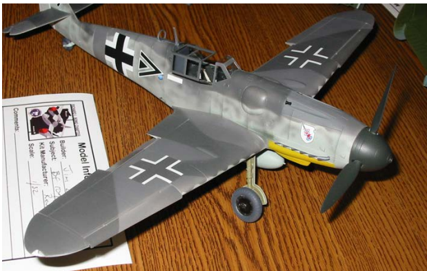
Jim Zeske Bf 109 G-6 Revell G 1/32