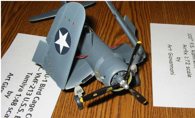
Art Giovannoni F4U-1 Corsair Tamiya 1/48