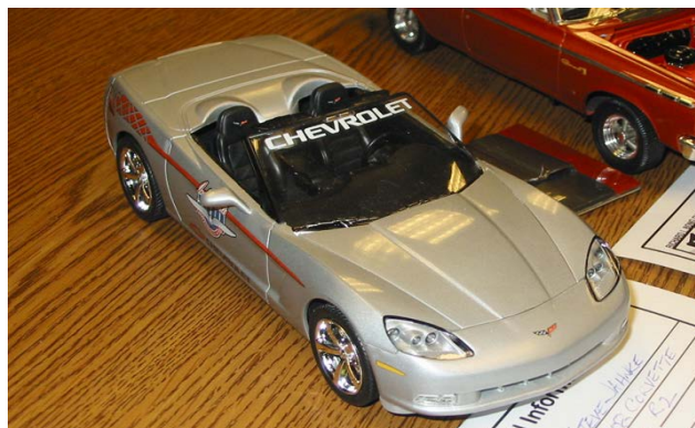
Steve Jahnke 2008 Corvette R2 1/25