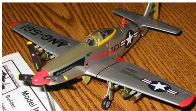
Walt Fink P-51H RS Models 1/72