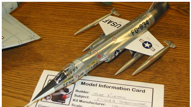
Mike Klessig F-104A Starfighter Italeri 1/72