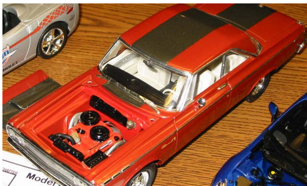
Steve Jahnke 64 Dodge 1/25