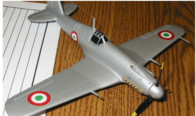
Dave Hansen Fiat G.55S Silurante Supermodel 1/72