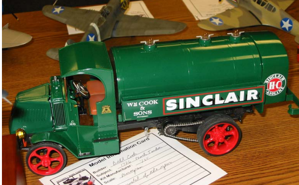
Bill Cook 26 Mack Truck Monogram 1/25