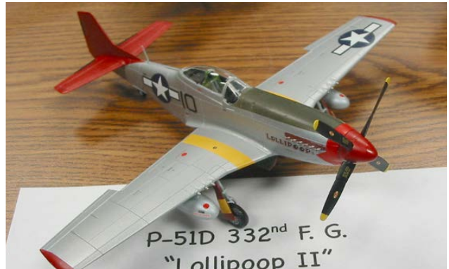
Art Giovannoni P-51D Airfix 1/72