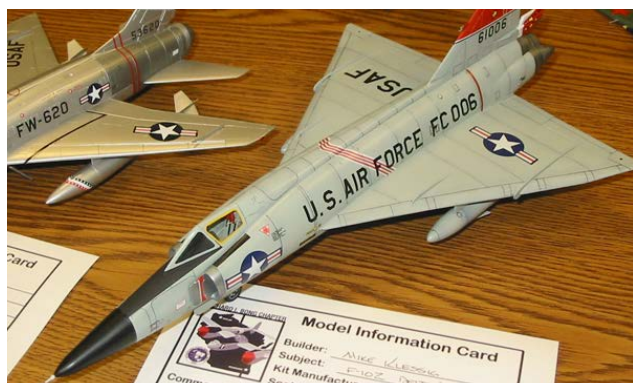
Mike Klessig F-102 Delta Gagger Meng 1/72