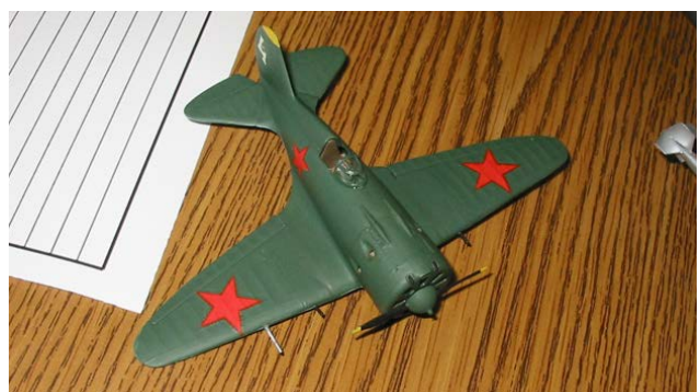
Dave Hansen Polikarpov I-16, type 24 Revell 1/72