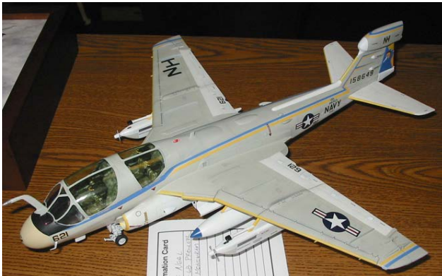
Jeff Neal EA-6B Prowler Monogram 1/48