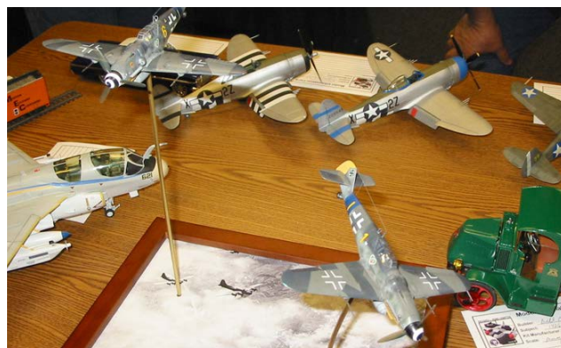
Bryant Dunbar Me 109 Fine Molds 1/72