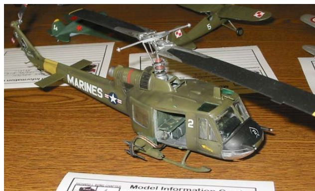
Bruce Szewczuga Huey Hog Monogram 1/48