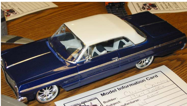
Chris Ogelsby 64 Impala AMT 1/24