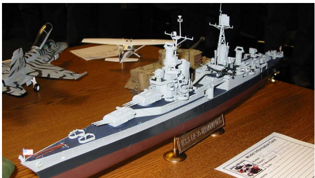
Tom Foti USS Indianapolis Academy 1/350