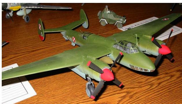
? No Card