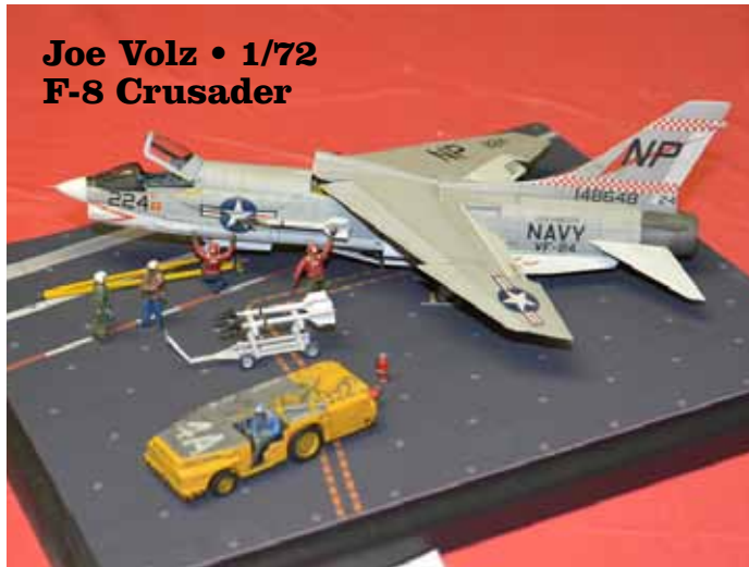
Joe Volz • 1/72 F-8 Crusader