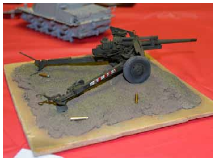
M5 3in. gun, 1/35, by Lou Ursino