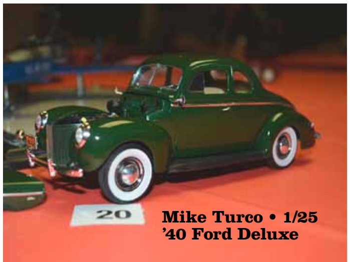
Mike Turco • 1/25 '40 Ford Deluxe