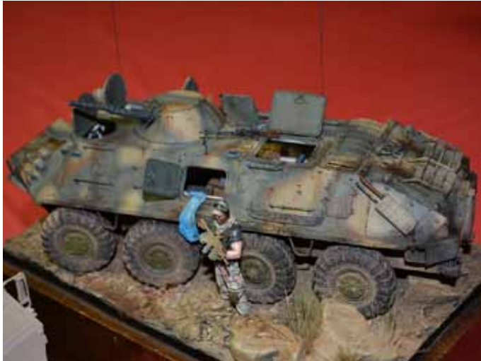
BTR-80, 1/35, builder not recorded