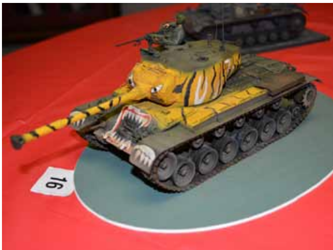
M46 Patton Tank, 1/35, by Lou Ursino