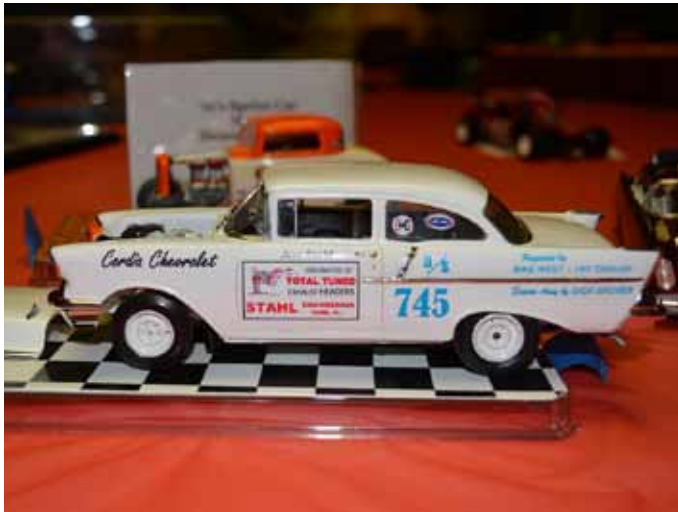
'57 Chevy 150, 1/25, by Joe Sander