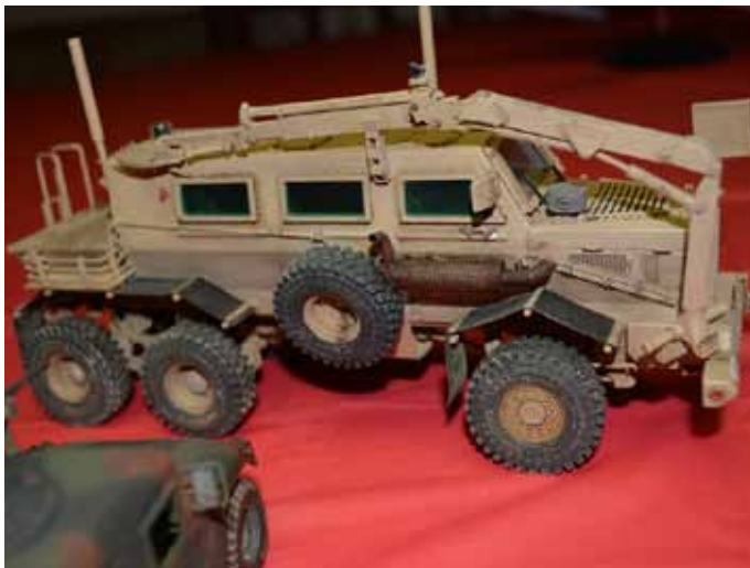
Buffalo MRAP, 1/35, builder not recorded