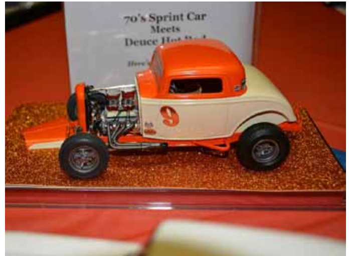
'32 Ford Three-Window Coupe, 1/25, by Joe Sander