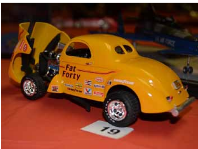
'40 Willys Coupe, 1/25, by Mike Turco