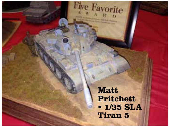
Matt Pritchett • 1/35 SLA Tiran 5