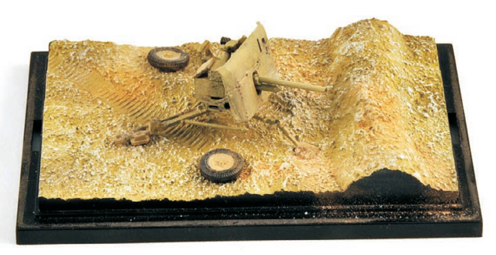
Joseph Roper's 1/72nd scale 2 pounder gun