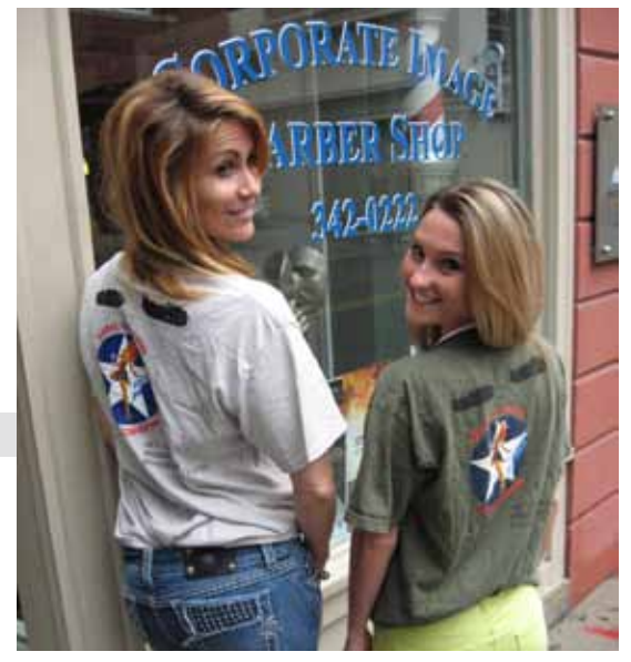
The stylists at the Corporate Image Barber Shop in downtown Roanoke promote the Region 2 IPMS Convention.