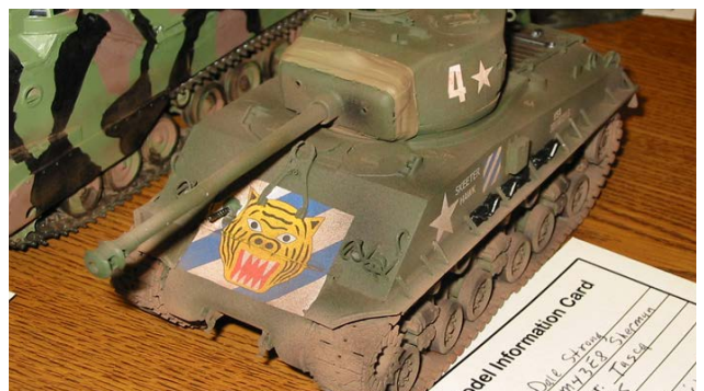
Dale Strong M43E8 Sherman Tasca 1/35