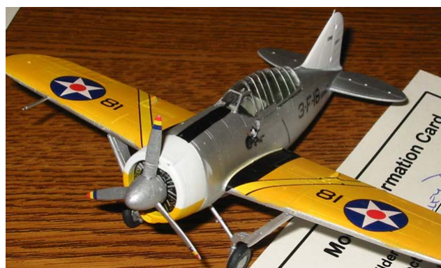
Carley Davis Brewster Buffalo Hobby Boss 1/72