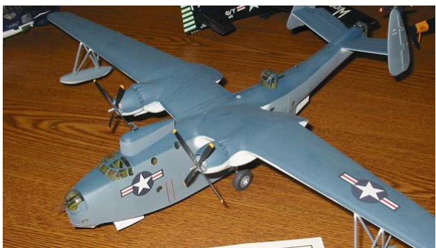
Paul Boyer PBM-5A Minicraft 1/72