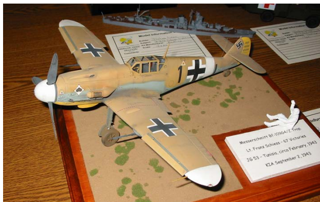
Dean Hervat Bf-109 64 Revell 1/32