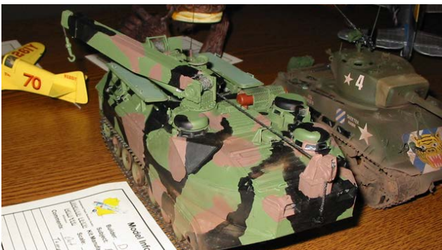
Dale Strong AAVR-7A1 Ram/RS Hobby Boss 1/35