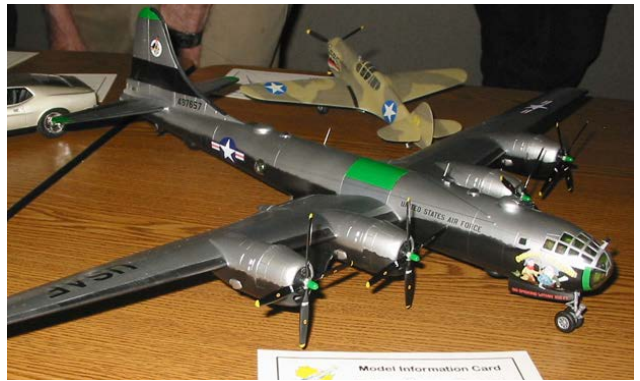
Paul Boyer B-29 Academy 1/72