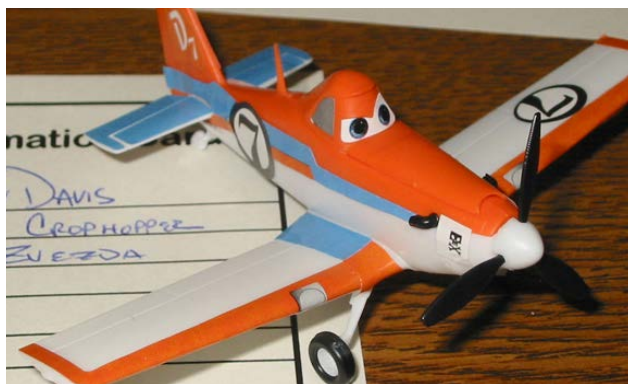
Carley Davis Dusty Crophopper Zveda 1/100