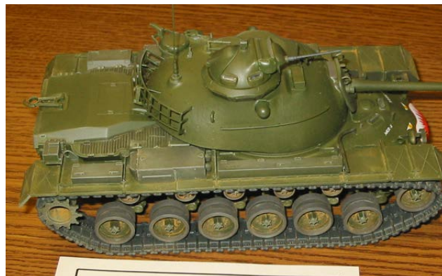
Jim Zeske M-48 Patton Dragon 1/35