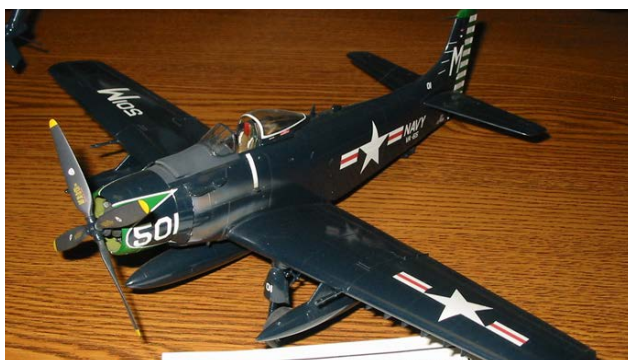
Larry Schramm A-1 Skyraider Monogram 1/48