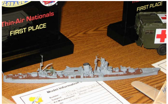
Joshua Simon IJN Light Cruiser Aoshima 1/700