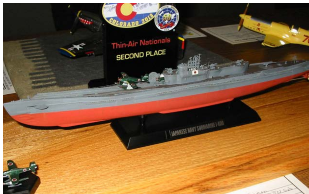
Joe Simon I-400 IJN Submarine Tamiya 1/350