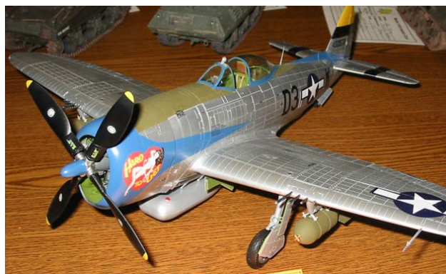
P-47D-30-RA Trumpeter 1/32