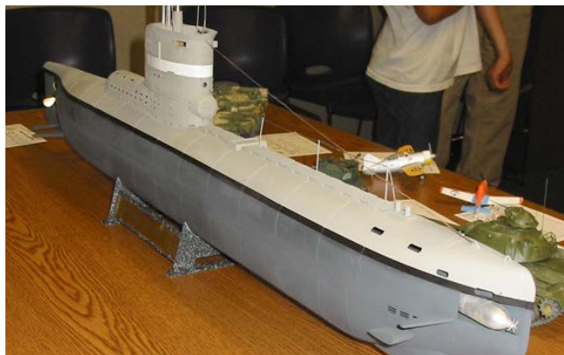
Tom Foti XXIII U-boat Bronco 1/35