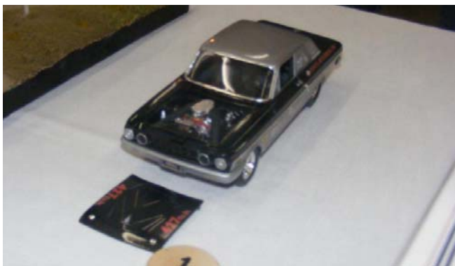
Silver: Brad Dutter's Revell 1/25 '64 Ford Fairlane.