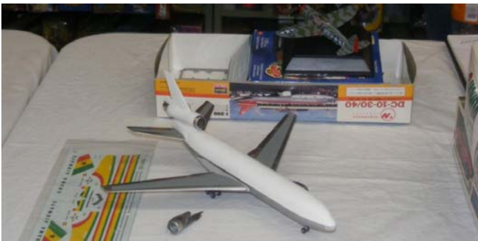
In Progress: Stewart Bailey's Revell 1/144 DC-10 and Alpha Force 1/100 P-47D.