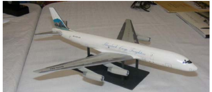
Kent Painter's Minicraft 1/144 DC-7-62 converted from a DC-8-63