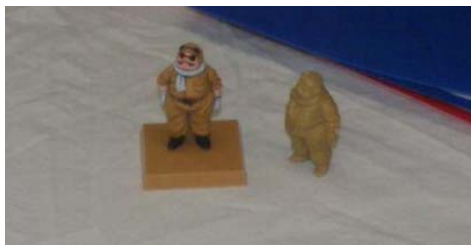
Display Only: John Mear's Fine Molds 1/32 Porco Rossi Figure.