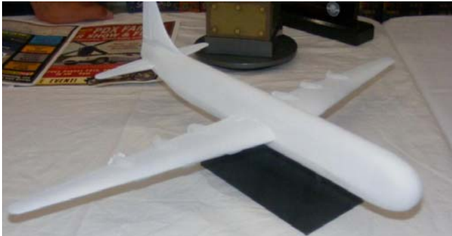
In Progress: Kent Painter's Scratchbuilt 1/144 XC-99.