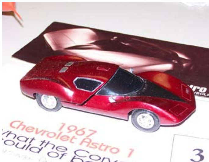
Chevy Astro I, 1/32, by Rod Rakos