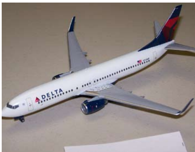
Delta Airlines Boeing 737-800, 1/200, by Joe Volz