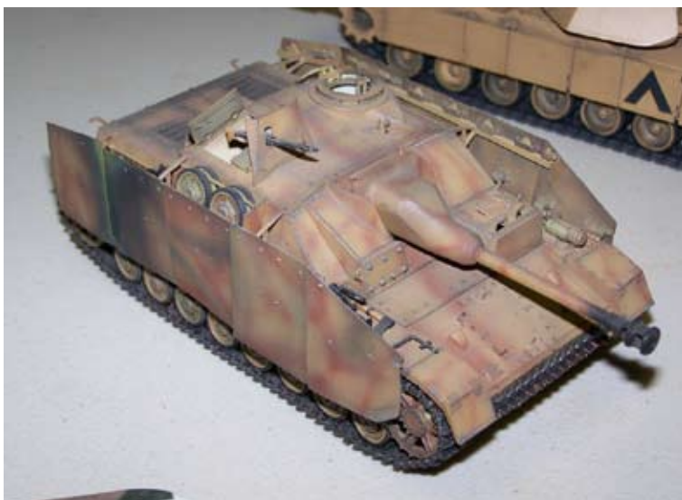
Sturmgeschutz III, 1/35, by Richard Boyd