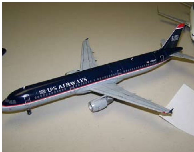
US Airways Airbus A-321, 1/144, by Joe Volz