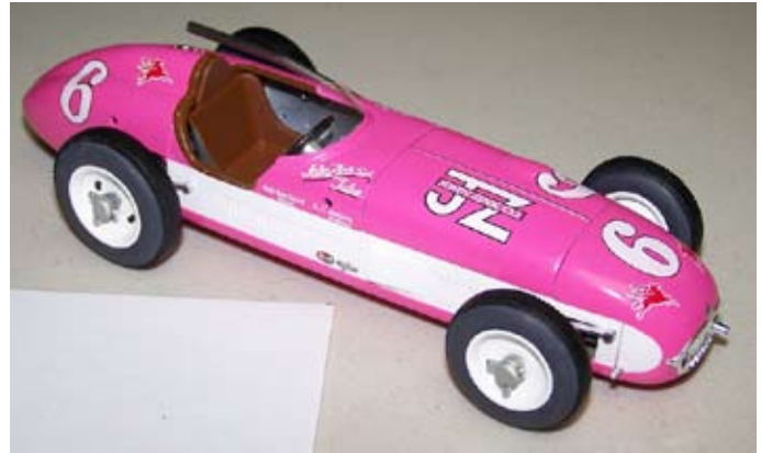
1955 Indy 500 Winner, 1/24