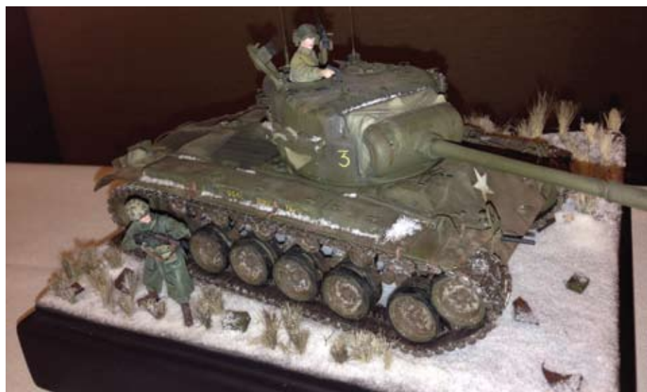
Two entries from ArmorCon 2013.