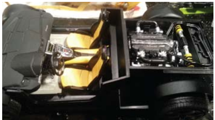
The Lambo in progress.

I had to temporarily assemble the body for the pearl coat. Once I was satisfied with that, it was taken apart and shot with Eastwood 2 part urethane clear.