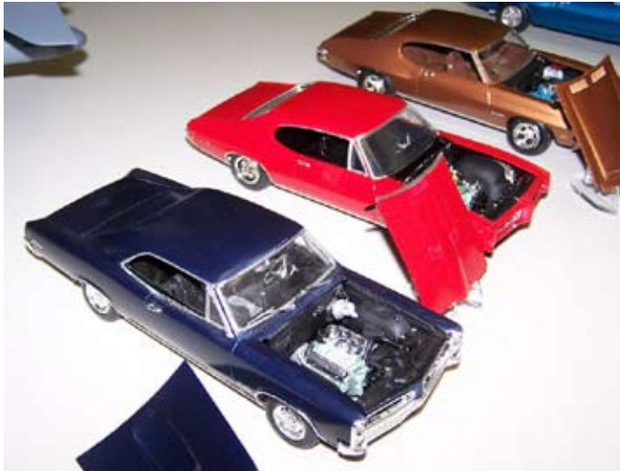
'66, '68, '71 Pontiac GTOs, 1/25, by Butch Haas