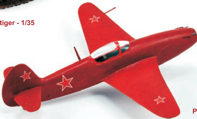
PM Models Yak-15 - 1/72