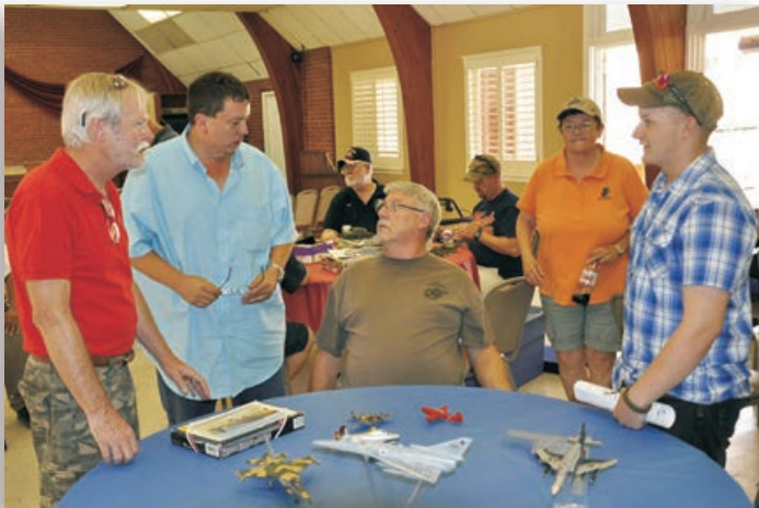
Our guys discussing Models. What else?