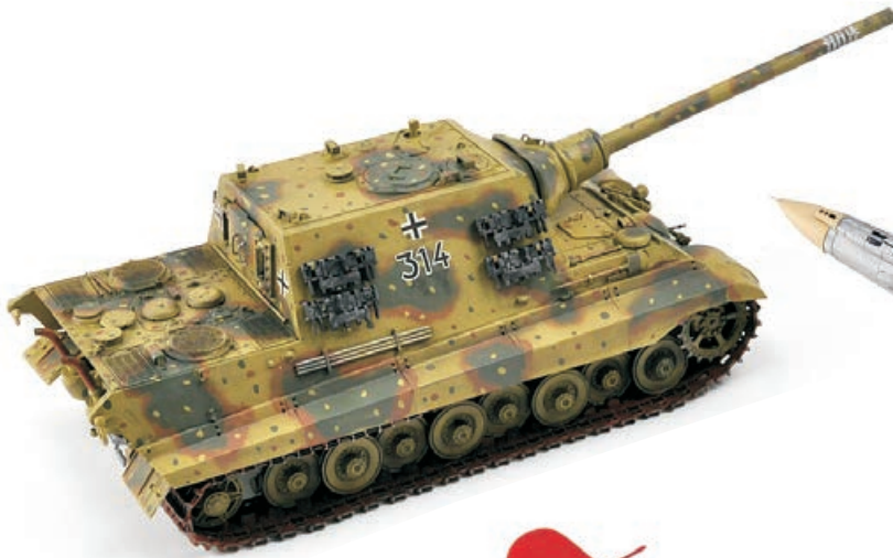
Dragon Jagdtiger - 1/35