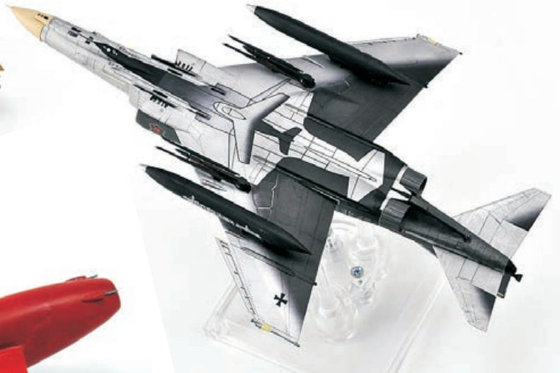
Revell F4-F Phantom - 1/72