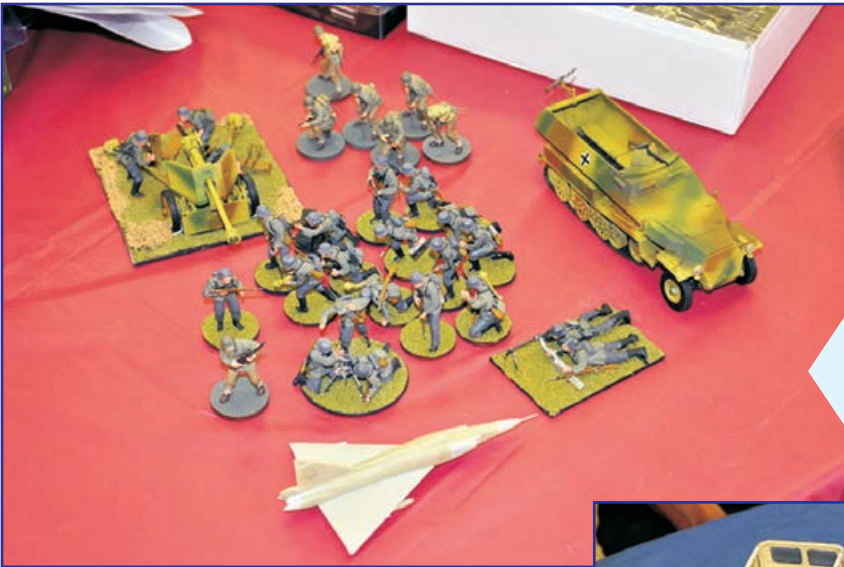
Joe Steadman's WIP F-102 and Figures