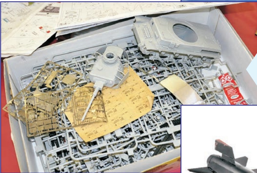
Roy Lingle's in-Progress armor pieces