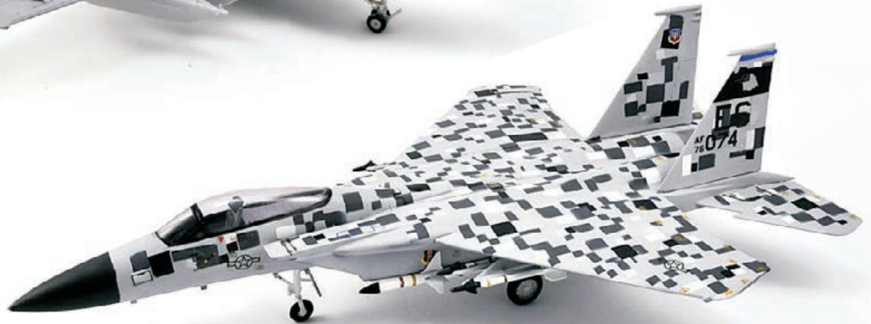
Carlos Delgado's F-15 Eagle in 1/48th scale