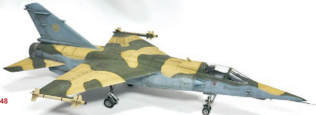
ESCI Mirage F1CZ - 1/48