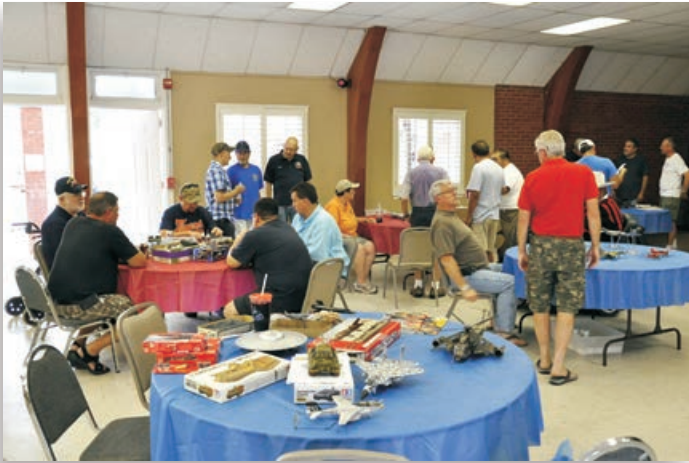
A Busy Meeting, as Usual