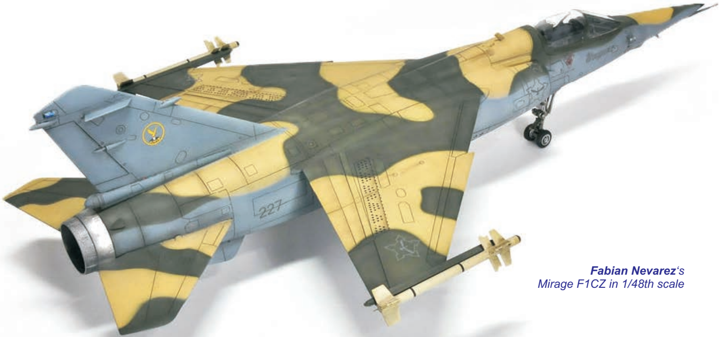
Fabian Nevarez's Mirage F1CZ in 1/48th scale