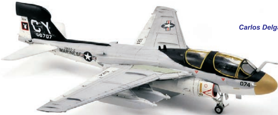
Carlos Delgado's EA-6 Prowler in 1/72nd scale