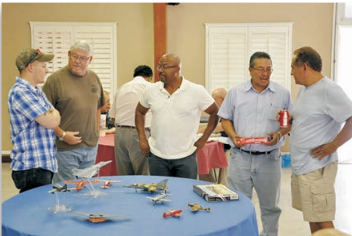
Friendly chat around a Display table