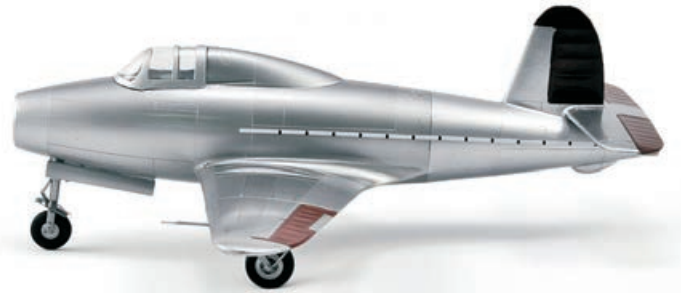
Special Hobby Gloster E.28/39 - 1/48